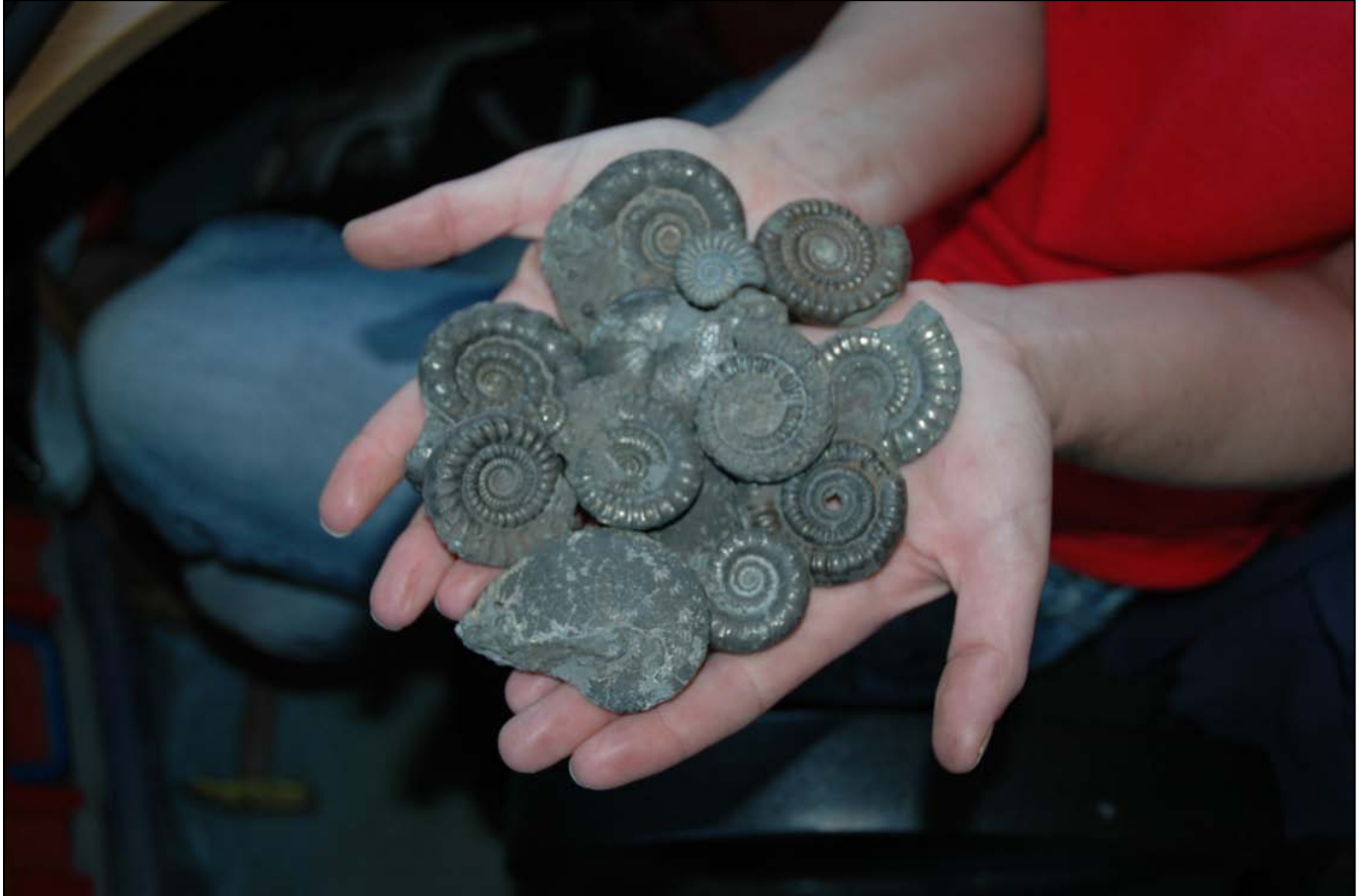
Fossils can be abundant following storm events; this handful is just part of a collection made in less than an hour immediately after a storm. Not surprisingly, these ammonites are common and well represented in museum collections across the country.