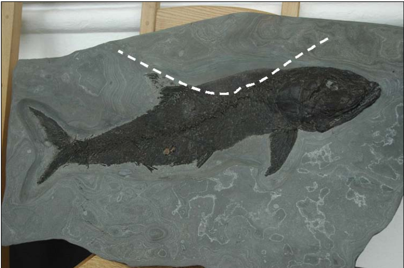
A large (90cm long) fish, Furo sp from the Blue Lias reefs in front of Church Cliffs Lyme Regis. Part of the dorsal body has been washed away by the sea before the specimen was rescued. Despite the collecting effort specimens of key scientific importance remain at risk and are rescued just in the nick of time.

Note from the editor: Any responses to the hearing would also be of interest to ProGEO NEWS. Debate over management strategies is always useful and it is an interesting perspective to compare the strategy outlined here with the strategies found in the international Geopark movement.