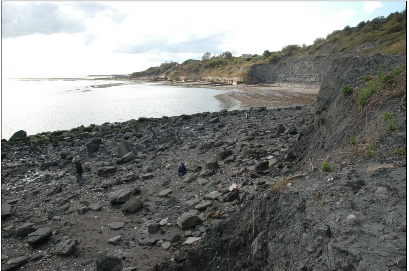
Spittles landslide in the autumn of 2008. The volume of rock removed by the sea at the toe of the landslide is enormous. This area continues to release a wealth of fossils from ammonites to fish, sharks, rare lobsters, ichthyosaurs and even a dinosaur, Scelidosaurus.

a new build centre or museum in a less expensive location and where the same funding could provide a bigger space. This is a complex issue but the code certainly increases the likelihood that important specimens will be acquired while the complete resolution of this issue lies outside the code and working group in that it involves museum curators, scientists and funding agencies working together with the partners of the code, particularly the statutory agencies, the landowners and, of course, the collectors.