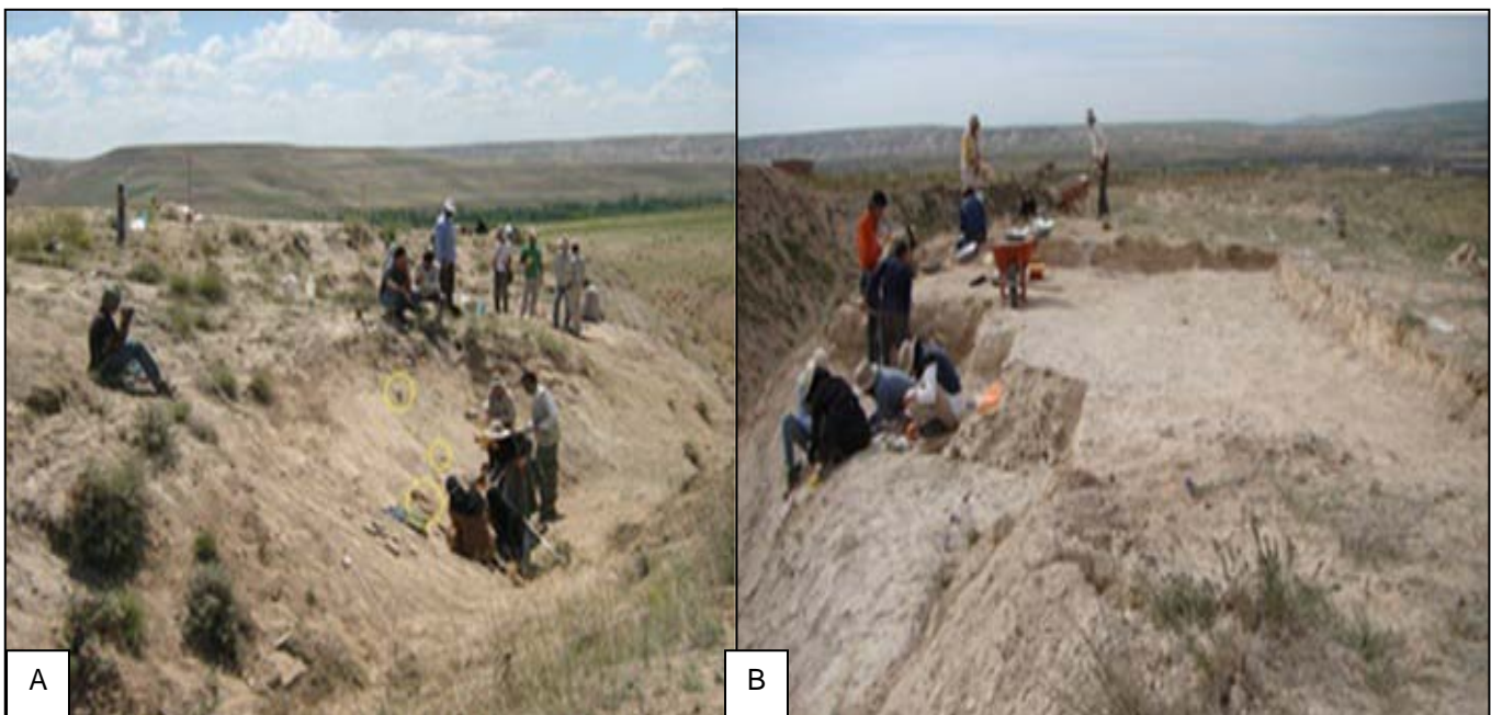
Two sites of Maragheh (A: Dar-e-gorg, B: Dar-e-azim).