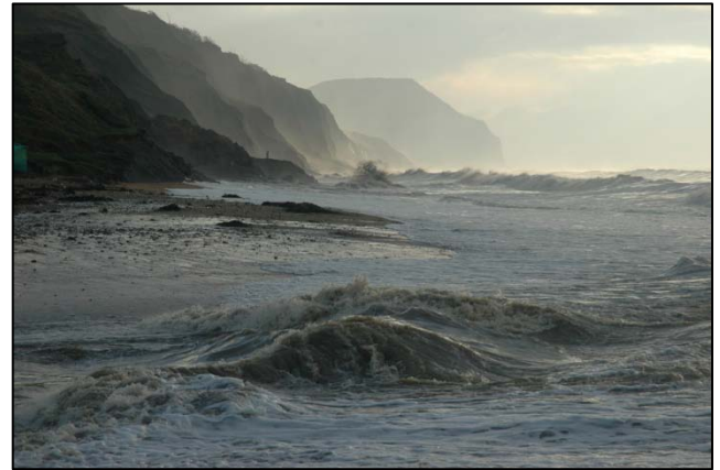
A rapidly eroding coastline. The Spittles landslide of May 2008, just east of Lyme Regis. Three hundred metres of Lower Lias strata collapsed onto the beach in less than an hour. Erosion is very episodic and unpredictable and can often be very dramatic.

The Code then outlines responsibilities amongst collectors. Specimens of key scientific importance should be offered first to accredited museums if they are to be donated or sold. Collecting in situ is restricted and the fossils within the cliff sections may only be removed with permission from the landowner unless these are specimens (principally vertebrates and large crinoid slabs) at immediate risk of being damaged or destroyed by the sea or found by others, where these may be extracted immediately and retrospective permission sought.