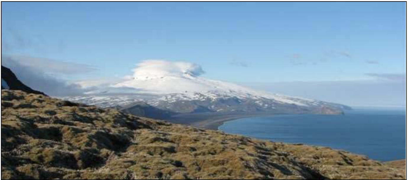
Beerenberg.