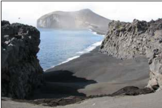
Jamesonbukta (Jameson Bay) towards Eggøya.

Jan Mayen was in 2007 forwarded as a Norwegian candidate for UNESCO World Heritage list together with the small Antarctic island Bouvetøya. This nomination is a part of an international series nomination including all islands on the mid Atlantic Ridge.