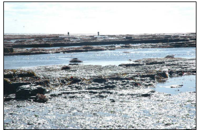
Broad Ledge east of Lyme Regis. Local collectors are often seen walking the ledges on a low tide. The spring tides are predictable but local conditions affect the height of the sea and the quality of the ledge. Stormy weather results in a 'poor' low tide while calm weather can cause the tide to recede a long way. Calm conditions typically result in the ledges being covered in mud making the location of marine reptiles very difficult indeed.

The code would appear to have fulfilled the priorities in that fossils are recovered rather than destroyed and that everyone has an opportunity to view most of what has been found. Digging in the cliffs has been greatly reduced and supported by an unprecedented legal action by the landowners signed up to the code. The fossils of stratigraphic significance in situ remain reserved for scientific study where they can be and have been accessed for study. The earth science interests of the West Dorset coast are in favourable condition. The record of key scientifically important fossils, while not absolutely complete, does capture the history of important finds over the last decade. There is evidence to suggest that not all fossils of scientific importance are being registered but it is likely to be a small number as there is no reason why collectors would not wish to register specimens.